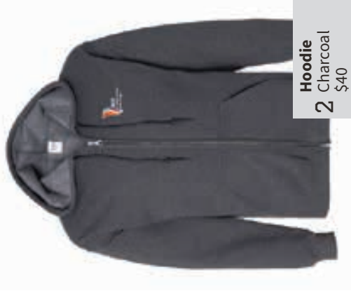
Hoodie 2 Charcoal $40