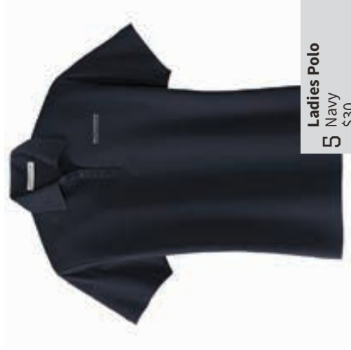
Ladies Polo 5 Navy $30