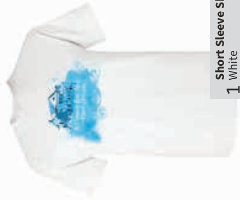
Short Sleeve Shirt 1 White $15