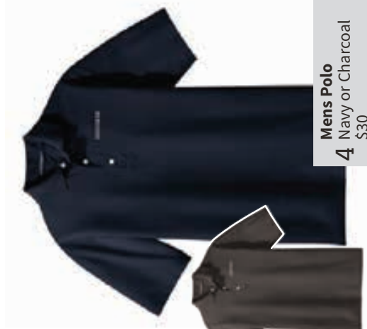
Mens Polo 4 Navy or Charcoal $30