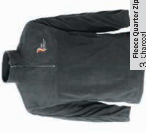
Fleece Quarter Zip 3 Charcoal $45