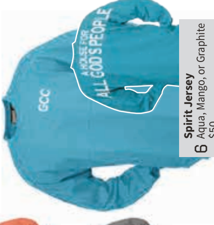
Spirit Jersey 6 Aqua, Mango, or Graphite $50